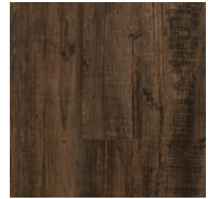
32LP1023 | 32LP1023G Long Pine Black & Tan