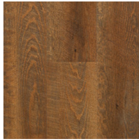
32IN544 | 32IN544G Flamed Oak Canyon