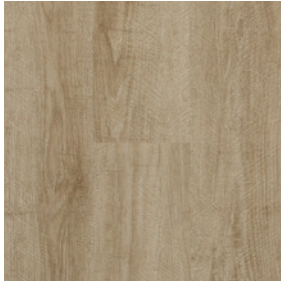
32C0082 | 32C0082G Cooper's Oak Bay