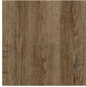
32C0083 | 32C0083G Cooper's Oak Roan