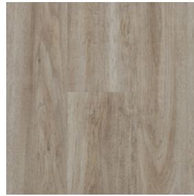
32LDP151 | 32LDP151G Lodge Plank Gray Pearl