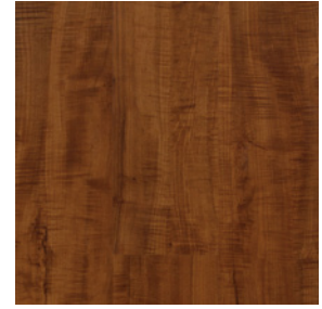
32IN401 | 32IN401G Jatoba Cayenne