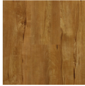
32HM186 | 32HM186G Heart Maple Golden Rose