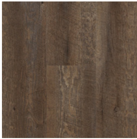
32IN542 | 32IN542G Flamed Oak Pewter